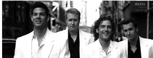
TRIBUTE TO FRANKIE VALLI OCTOBER 14, 2011

The Unexpected Boys have amazed audiences all over the world with their award-winning tribute to one of the most recognized bands to ever hit the airwaves...Frankie Valli and The Four Seasons. Don't miss your chance to see these Jersey wise guys, who between them have performed in 12 different shows on Broadway, including such hits as Phantom of the Opera, Les Miserables, Hairspray and Wicked!