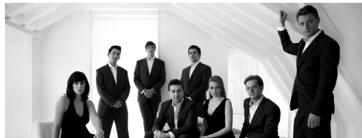
VOCES8 FEBRUARY 5, 2012

The Unexpected Boys have amazed audiences all over the world with their award-winning tribute to one of the most recognized bands to ever hit the airwaves...Frankie Valli and The Four Seasons. Don't miss your chance to see these Jersey wise guys, who between them have performed in 12 different shows on Broadway, including such hits as Phantom of the Opera, Les Miserables, Hairspray and Wicked!